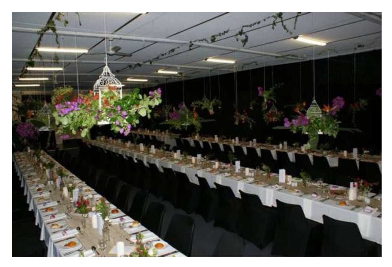
Annual Dinner featuring the "Hanging Gardens of Wembley Downs Tennis Club"!

Congratulations to the many trophy and award winners. You are a credit to WDTC and yourselves. Long may you continue playing tennis.