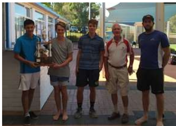
Alan Hill Perpetual Trophy